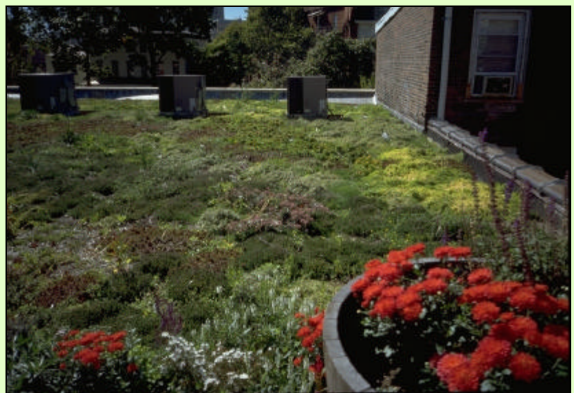
Figure 1. Fencing Academy of Philadelphia vegetated roof cover.